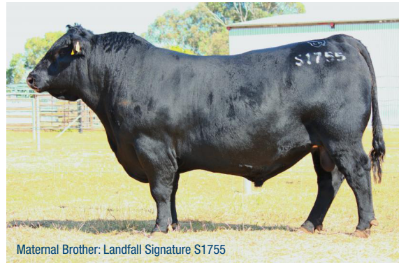
Maternal Brother: Landfall Signature S1755