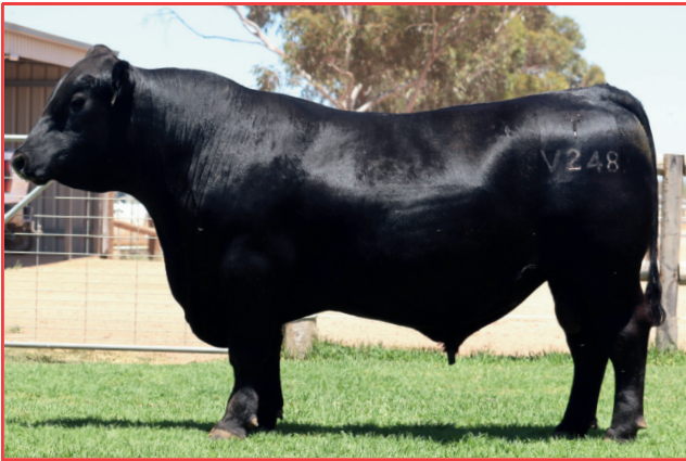
Progeny: Goolagong Vegas V248

DOB: 21/08/2023 | BW: 36kg | YW: 675kg | SS: 44cm |