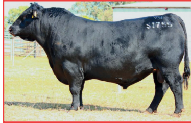
Sire: Landfall Signature S1755

For a bull just 17 months old, who has already joined a group of heifers and then backed up another group of cows at Pathfinder in a tough season, we think he's made of the right stuff. USE VIAGRA to maintain frame, add performance and bone, with more muscle than your average 5+ IMF bull.