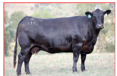
PGD: Rennylea H414