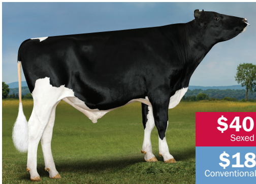
SANDY VALLEY SKYMOON-ET

SANDY VALLEY SKYMOON-ET Bull ID: 94H021237 NASIS: 80FFVA1