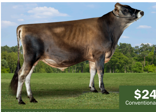
MURRAY BROOK KIRKY

MURRAY BROOK KIRKY Bull ID: CSCKIRKY NASIS: 29JJY06