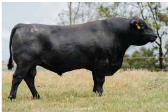
February 2026 TACE EBV's