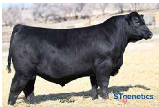
February 2026 TACE EBV's