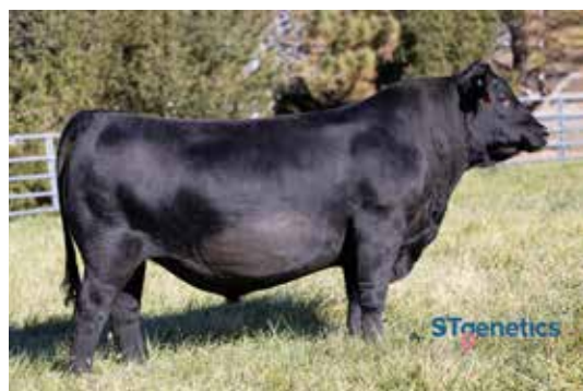
February 2026 TACE EBV's