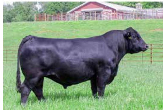
February 2026 TACE EBV's