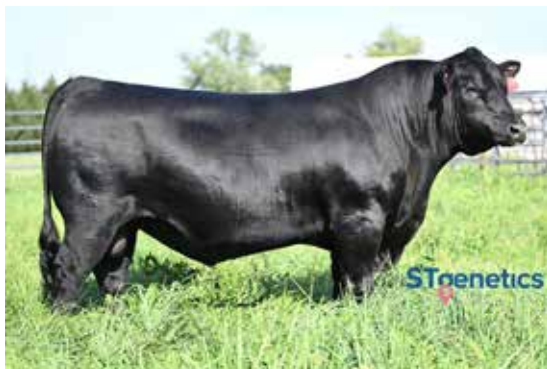
February 2026 TACE EBV's