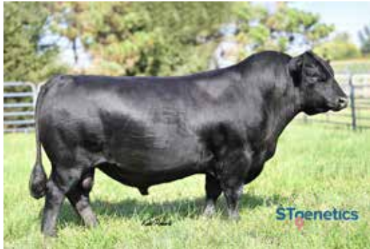
February 2026 TACE EBV's